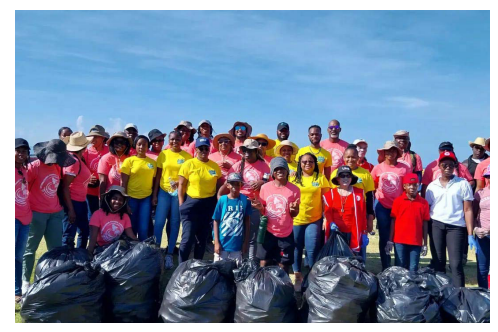
Volunteers from the Forestry Department, Heart Trust NTA and Jamaica Red Cross pause for a photo during the coastal cleanup