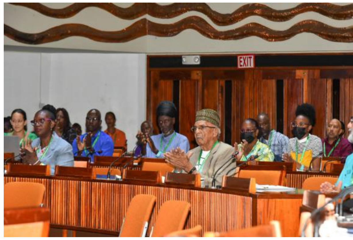
Attendees give a round of applause as they participate in the National Forestry Conference on Wednesday, DCecember 7, 2022.

ramps up measures to increase the country's forest cover under the National Tree Planting initiative.