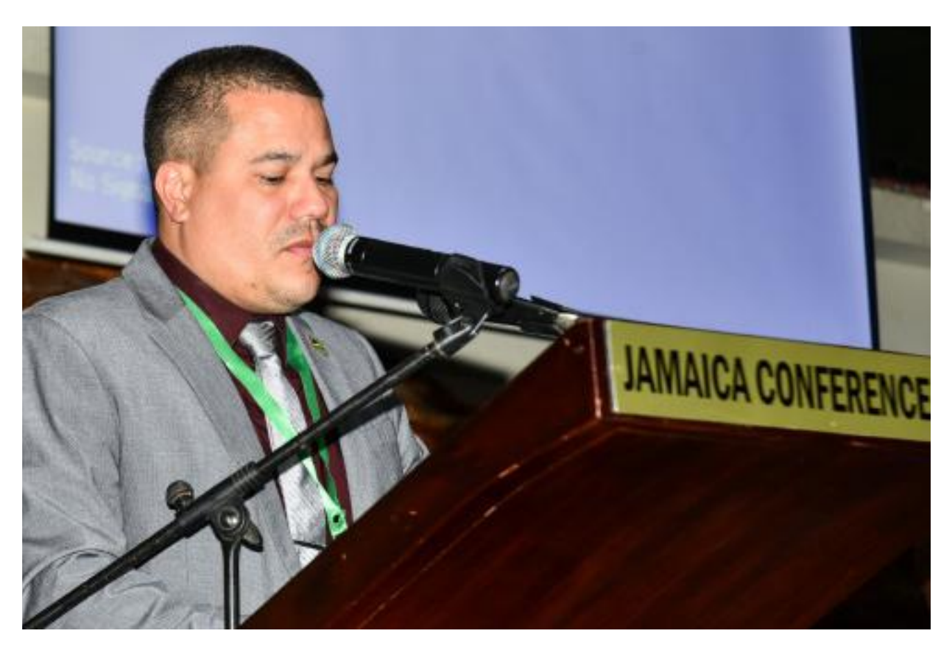
Minister without Portfolio in the Ministry of Economic Growth and Job Creation, Senator the Hon. Matthew Samuda, addresses the inaugural staging of the Forestry Department's National Forestry Conference held at the Jamaica Conference Centre in downtown Kingston on Wednesday, December 7.

of academia, civil society, Local Forest Management opportunities for increasing the economic benefits Committees (LFMCs) and other key players in the of forests without compromising their social and local forestry sector met at the inaugural National environmental benefits. Forestry Conference at the Jamaica Conference Centre in downtown Kingston.