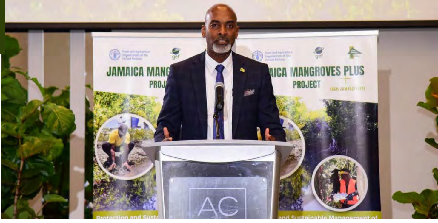
Chief Executive Officer of the Forestry Department & Conservator of Forests, addresses Friday's (January 19) launch of the Jamaica Mangroves Plus Project at the AC Hotel in Kingston.

Jamaica's mangrove ecosystem is being strengthened under a project being implemented by the Forestry Department over a four-year period.