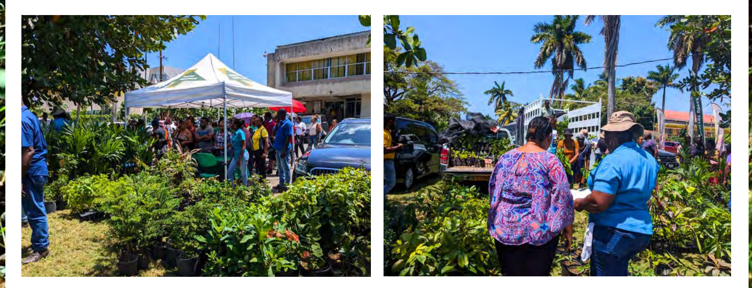
Customers line up to purchase or collect pre-ordered seedlings and potted plants at the Forestry Department's Plant Sale on International Day of Forests, March 21 held at the Catherine Hall regional office in Montego Bay, St. James.

The Plant Sale was one of the activities done by the Agency to celebrate the International Day of Forests.