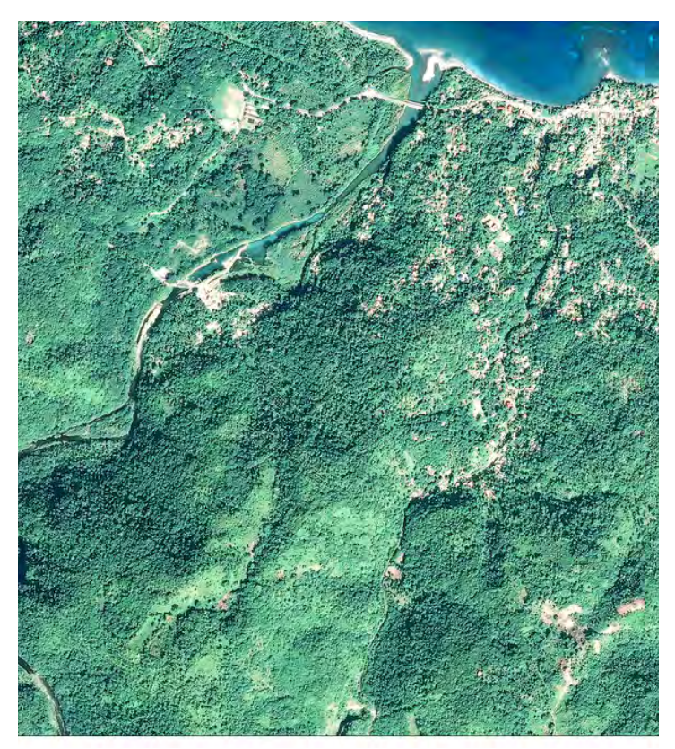
Satellite imagery showing Caenwood Forest Reserve in Portland, surrounding communities (Caenwood, Cooling Spring, Union and Hope Bay) and the lower course of Swift River where it meets the sea.

Agroforestry, for instance, integrates trees into agricultural landscapes, providing multiple benefits such as soil conservation, carbon sequestration, food security and diversification of income sources for local communities. Similarly, reforestation initiatives aim to restore degraded ecosystems, enhance biodiversity, and mitigate the impacts of climate change. By embracing these nature-based solutions, Jamaica can create resilient landscapes that support both ecological integrity and human well-being.